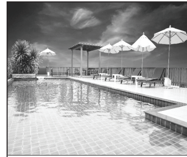
Pool / Water feature