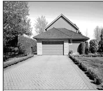
Driveway / Outdoor area