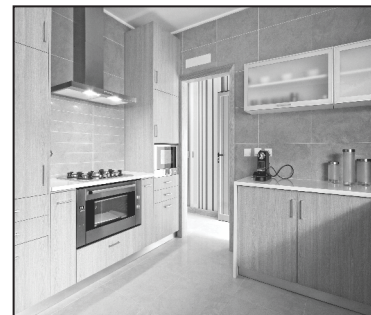
Kitchen / Dining