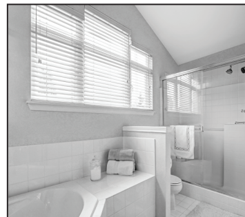
Bathroom / Shower area