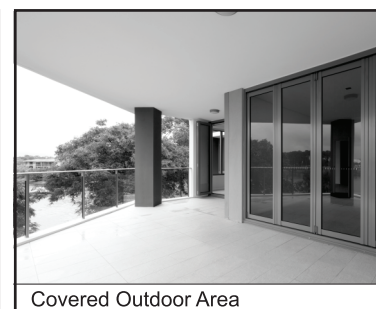
Covered Outdoor Area