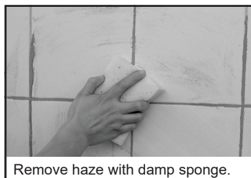
Remove haze with damp sponge.

After 5 minutes remove haze on tiles with a damp sponge. After 1 to 1 ½ hours, polish remaining residue with a lint-free cloth to reveal the grout color. Ready for foot traffic after 24 hours.