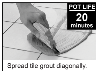
Spread tile grout diagonally.

TIP: Do not let grout mixture set on the tiles longer than 5 minutes, to prevent the tiles from being stained.