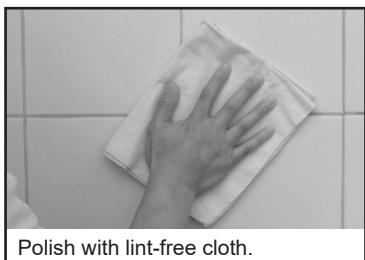
Polish with lint-free cloth.