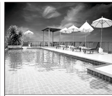
Pool / Water feature