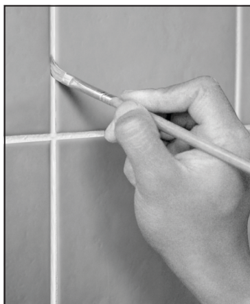
Application using artist brush

Note: Clean surrounding tile surfaces immediately after application. Do not allow excess ABC GROUT SEALER to dry on tiles.