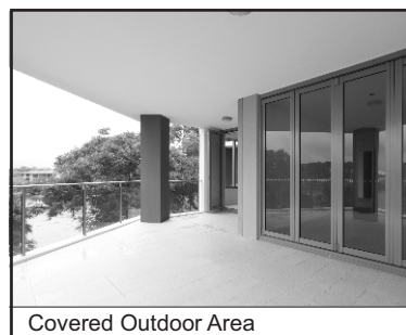
Covered Outdoor Area